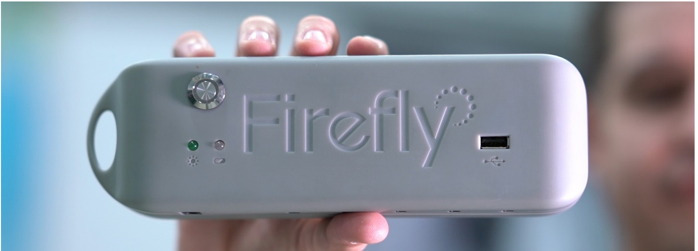
A Firefly controller prototype produced with a 3D Systems ProJet® MJP 2500 Plus printer.

A 3D Systems ProJet MJP 2500 enables better design, faster time to market, reduced costs, and the ability to quickly translate customer input into physical reality