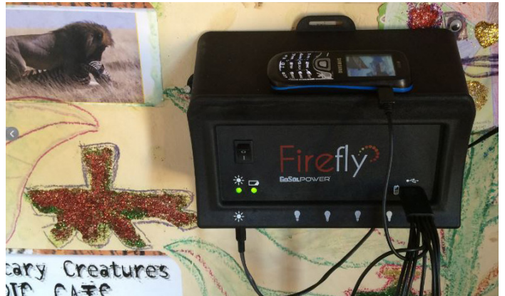
The controller for a Firefly solar-powered lighting system installed on a wall in Tanzania.