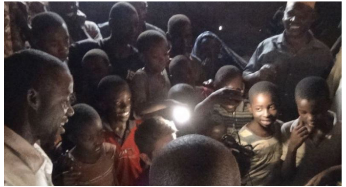
Villagers in Tanzania gather around the light from a Firefly system.

The ProJet MJP 2500 Plus offers true-to-CAD part quality in plastic and elastomeric materials that enable realistic functional testing. The high-resolution delivered by the MultiJet Printing technology provides micro-fine detail for even tiny features, along with sharp edges and corners. As a major bonus, the price was right for HPP.