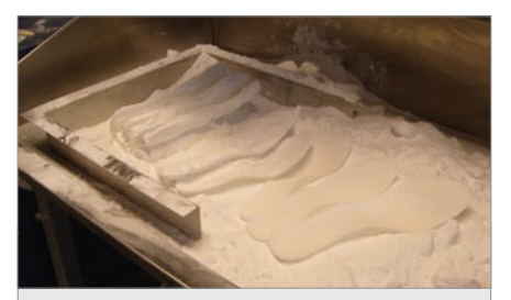
The spike soles were manufactured in a Vanguard selective laser sintering machine.

On the track, the influence of sprint spike stiffness on joint angles was measured at different stages of a 100-meter sprint (at 10 meters and 50 meters) using high-speed digital video that captured 1,000 frames