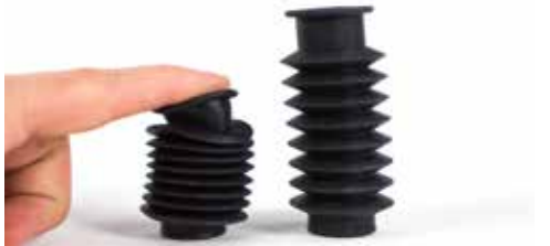
VisiJet M2 EBK