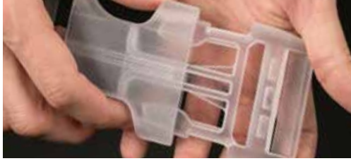
VisiJet Armor M2G-CL

Functional precision plastic and elastomeric parts with the ProJet® MJP 2500 Series