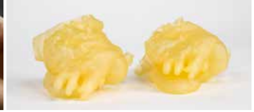
VisiJet M2 ENT