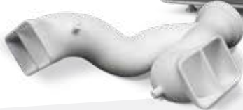
Manifold printed in DuraForm ProX FR1200