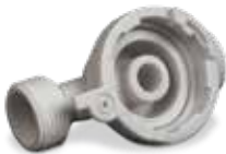
Hose fitting printed in DuraForm ProX GF