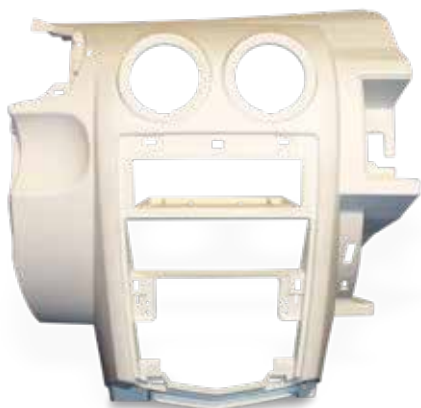
DuraForm PA Dashboard