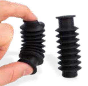
Combine pliability and strength to test elastomeric part designs in Visilet® M2 EBK (black) or ENT (natural).

Accessing high fidelity, functional plastic or elastomeric prototypes has never been faster, up to 3x higher 3D printing speeds than similar class printers, and easier with finished parts up to 4x faster than other cleaning methods.