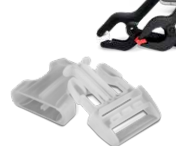
Engineering-grade VisiJet Armor M2G-CL material makes it possible to create sturdy buckle closures.