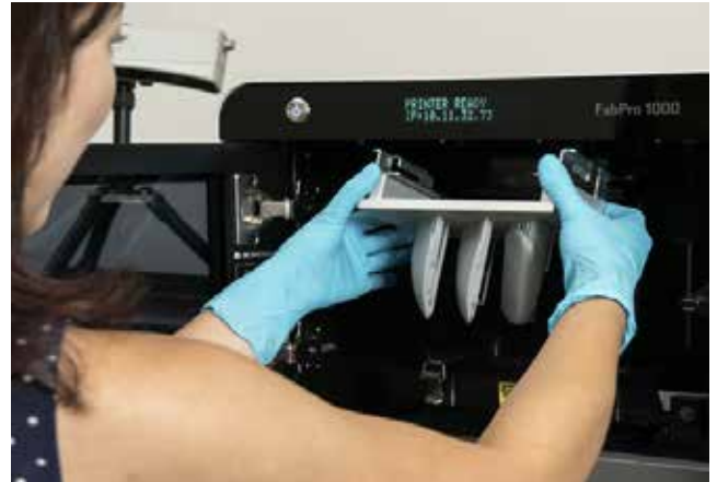
This desktop powerhouse packs industrial durability and reliability into a rugged yet compact platform.

FabPro 1000 will help shepherd the manufacturing process as ideas are validated and brought to production. FabPro 1000 assists engineers in creating accurate, functional prototypes that look and perform like final products. This makes it easier to verify the design, fit, function, and manufacturability before investing in expensive tooling and moving into production, when the time and cost to make change becomes burdensome. FabPro 1000 will quickly deliver functional prototypes for real-life testing to assess how a part will function when subjected to its expected usage.